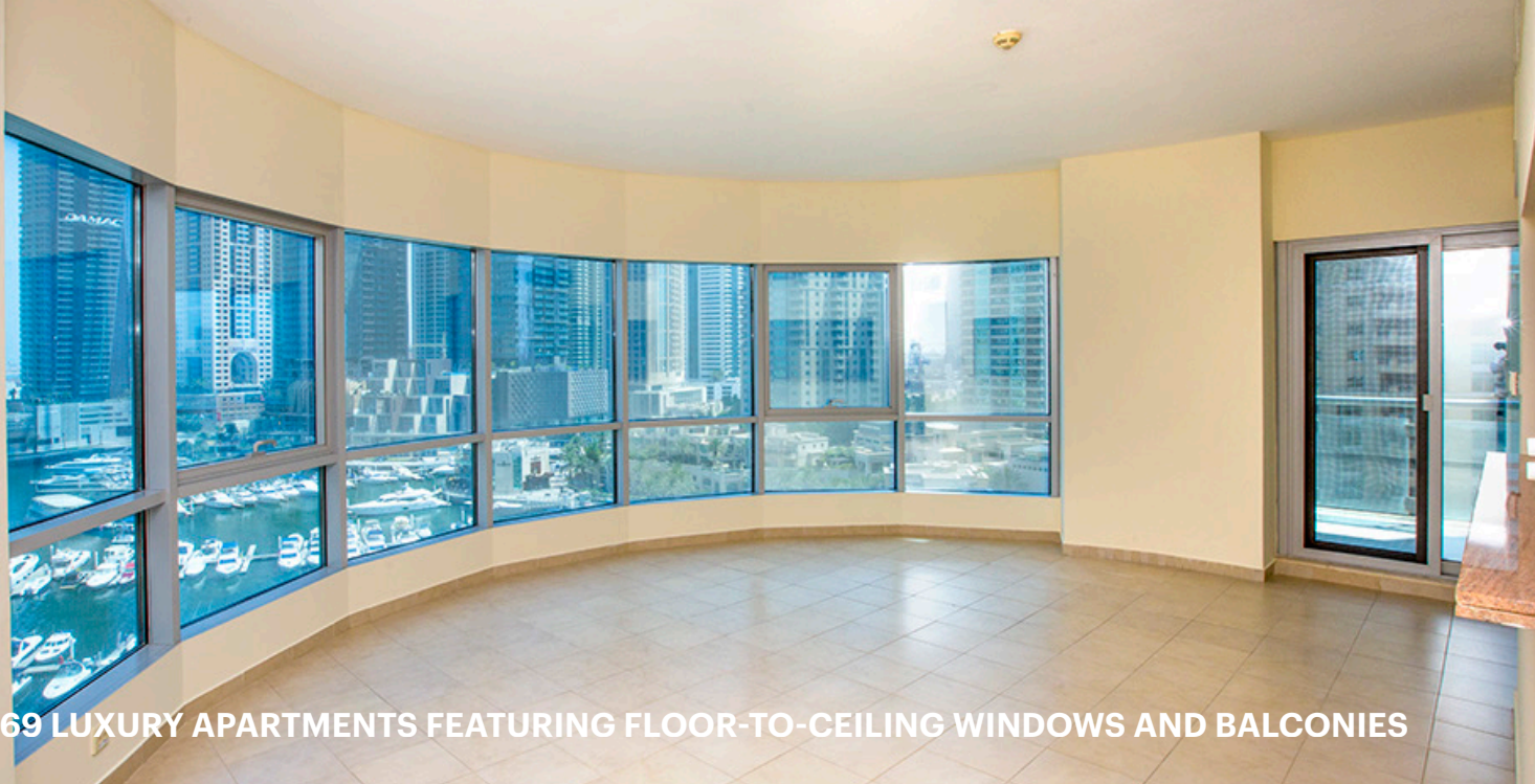
169 LUXURY APARTMENTS FEATURING FLOOR-TO-CEILING WINDOWS AND BALCONIES

Rental Rates starting from AED 100,000 per year